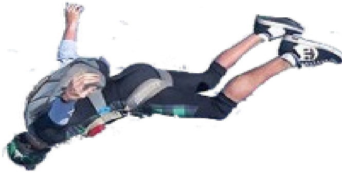
Belly position 2.