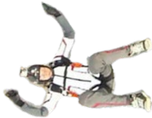
Vertical recovery position

NB: The position tends to fall more back-to-earth depending on arm position.