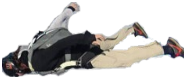
Belly position 1.

Hold the general body position required to stand on the ground looking forwards. Flyers must make sure their lower legs are exposed to the relative wind while on their belly. Arms are to the side of the body and slightly back. Being flatter in the air is the key to horizontal movement.